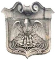
Pelican Center for Children & Families

The LBF Education Committee produces a continuing series of oral histories. The series is a part of the Committee's plans to systematically broaden the LBF's work to preserve the history, culture and flavor of Louisiana Law.